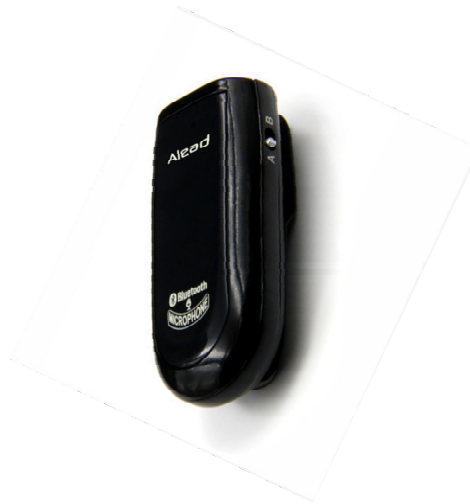
WIRELESS BLUETOOTH MICROPHONE